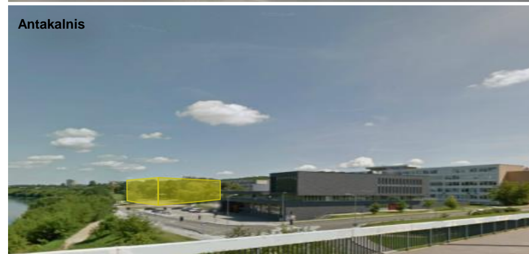
Foreseen locations of Police custody and Police station in Vilnius