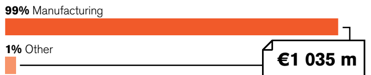
FDI BY SECTOR (2012)